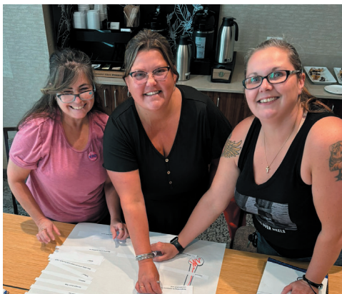
Members from the Duncan Superstore participate in advanced Shop Steward training to encourage stronger stewards and a stronger union on the floor and in our members' workplaces.

UFCW Local 247 members interested in attending future courses should reach out to their union representatives for more information, call 1-888-361-8329 or email training@ufcw247.com .