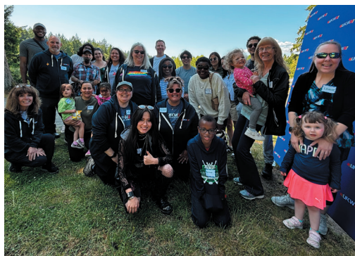
UFCW members and their families from Superstores in Langford and Duncan and the Victoria Wholesale Club attended a Union Picnic in Victoria in early June 2025.