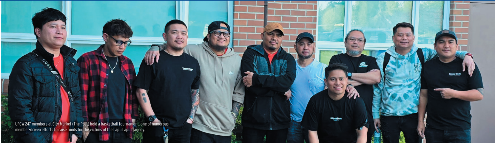
UFCW 247 members at City Market (The Post) held a basketball tournament, one of numerous member-driven efforts to raise funds for the victims of the Lapu Lapu tragedy.