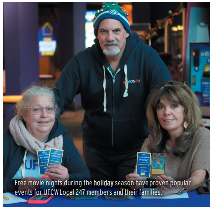
Free movie nights during the holiday season have proven popular events for UFCW Local 247 members and their families.

Driving the visibility of our union with new members, our Engagement Committee, together with the support of UFCW Local 247 leadership and staff, promise much more to come.